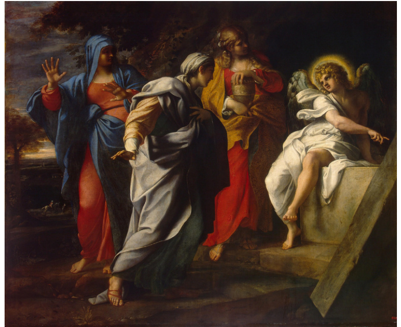
Holy Women at Christ's Tomb, by Annibale Carracci